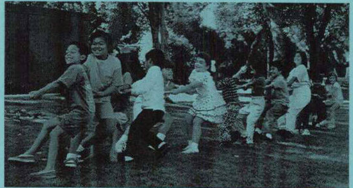
Everyone had fun at the neighborhood B.B.Q. on October 3.

Thanks to all the volunteers from Lakewood and the City of Sunnyvale who helped to make this event such an enormous success. ■