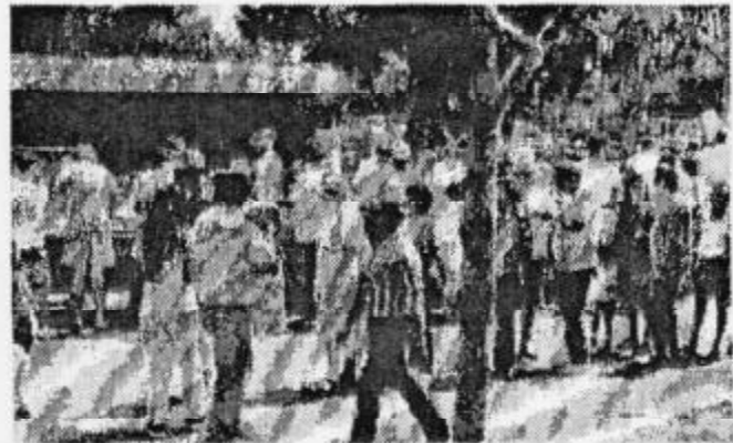
BBO at Lakewood Park April 25, 1992

Hello Lakewood and Fairwood, the Clean-up Community Picnic, held on April 25, 1992, at Lakewood Park was a success. I was there with my family and neighbors. Glad to see all of you there. The clean-up efforts of Partners was a stroke of genius. GOOD WORK PARTNERS!