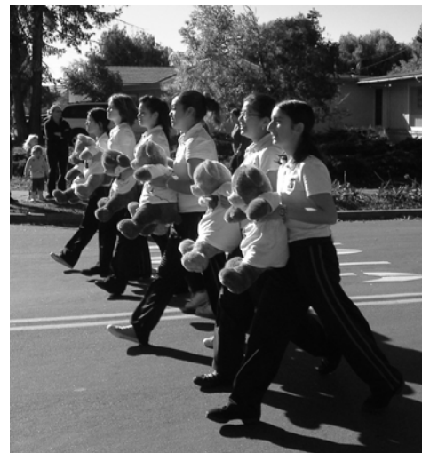
Teddy bear twirlers from the Fremont High School Band, in the LVNA 2006 holiday parade