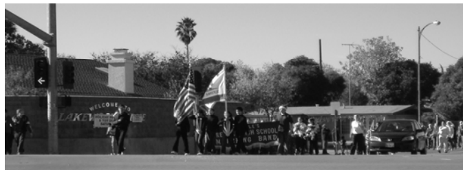
Holiday Parade marchers cross Lawrence Expressway

Thanks to parade helpers continued on page 3